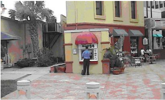
This ATM is placed well, using good CPTED features and has unobstructed view from the street and patrolling police.